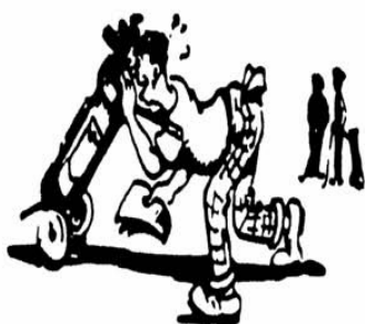
Golf Bag Snooper